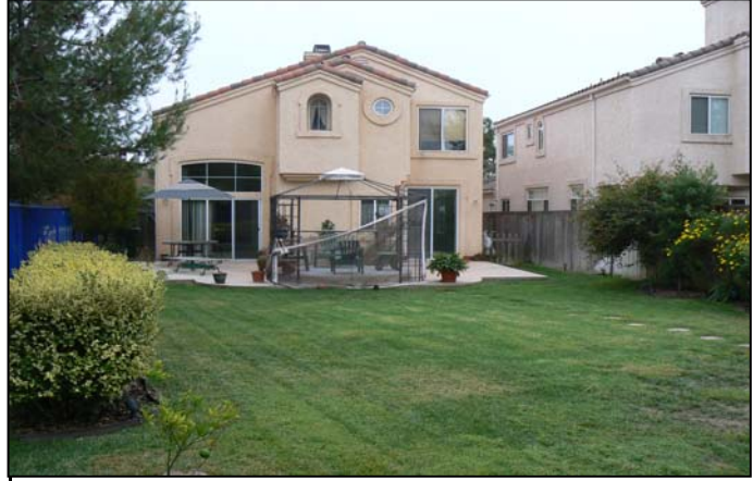
Backyard with trimmed landscape