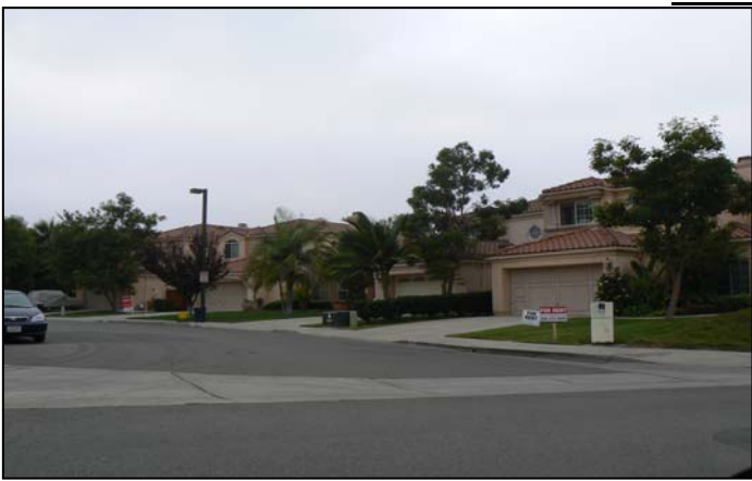
Street scene in front of home