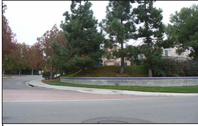
Street scene on side & back of home (Corner lot)