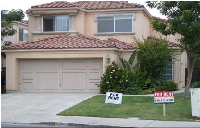
Front of home with For Rent signs