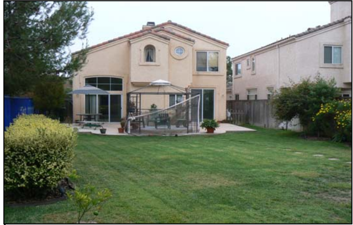
Backyard with trimmed landscape