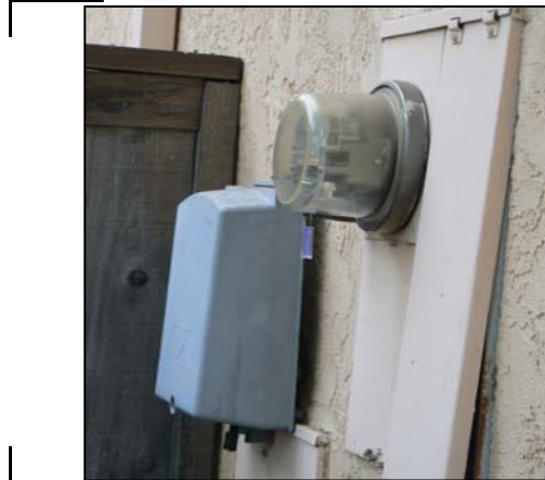
Electric meter is still active